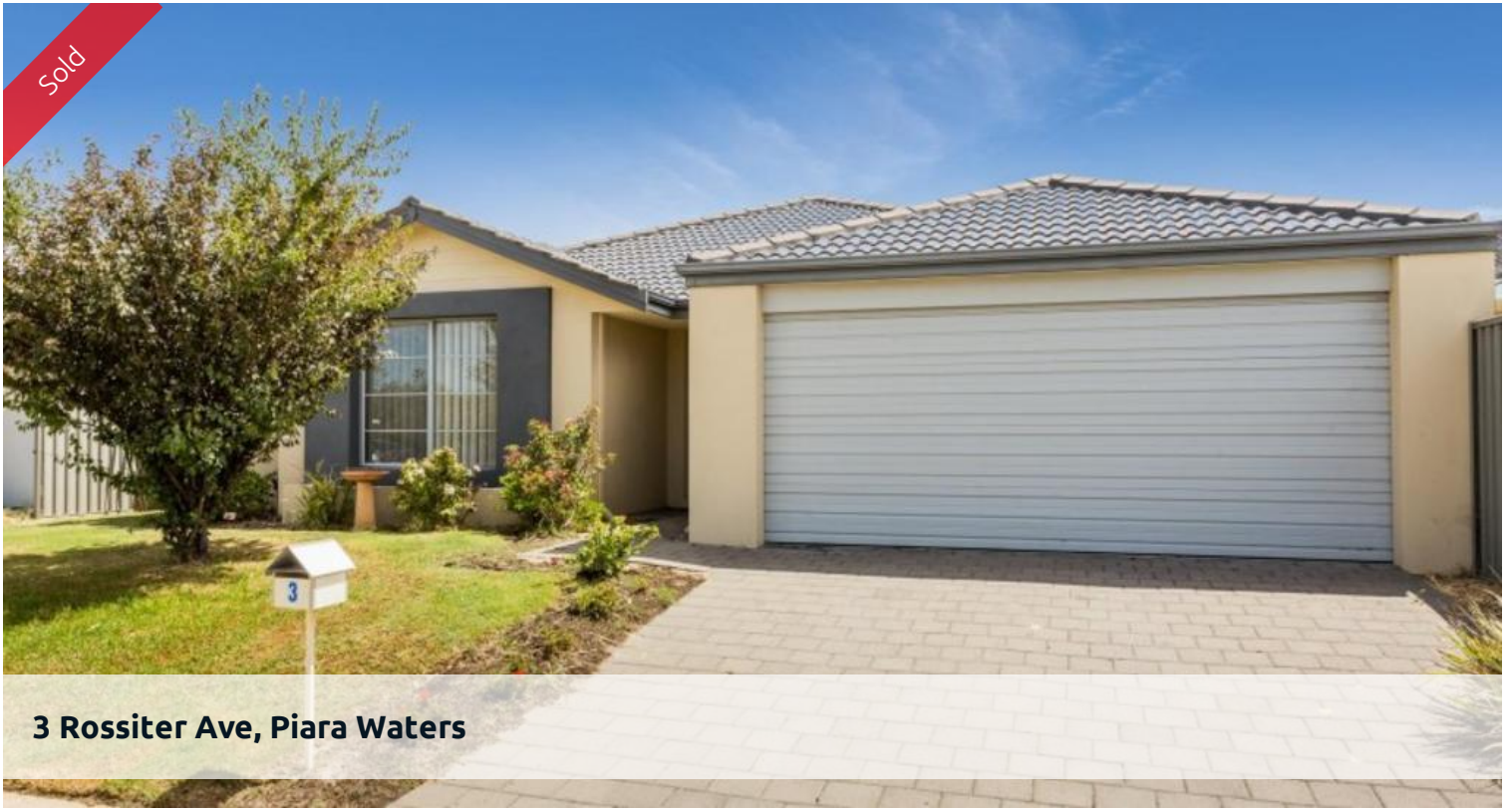
3 Rossiter Ave, Piara Waters